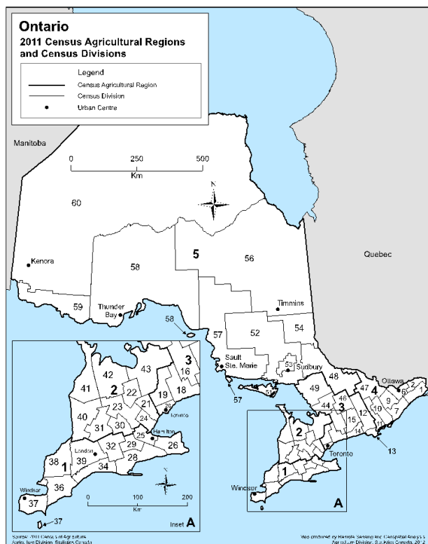
Map 1: All Regions of Southern Ontario

See the following maps below for visual representation: